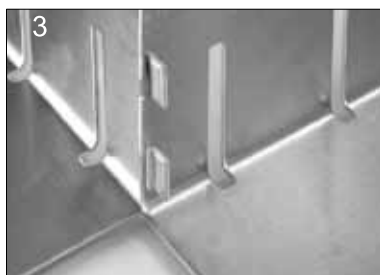
Inserting the joints