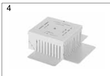
Putting on the top cover

Inserting the straight plates into the retainers and bending them