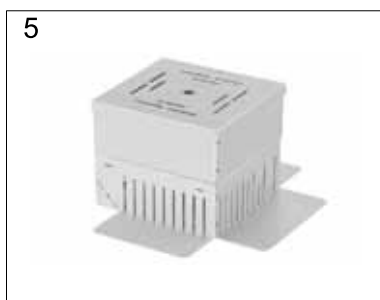
Also usable with extension chamber