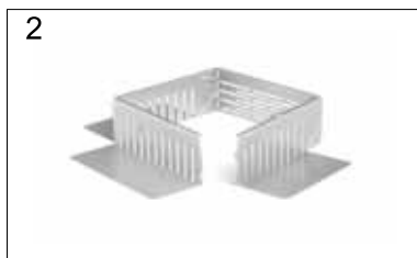
Folding of the inspection chamber